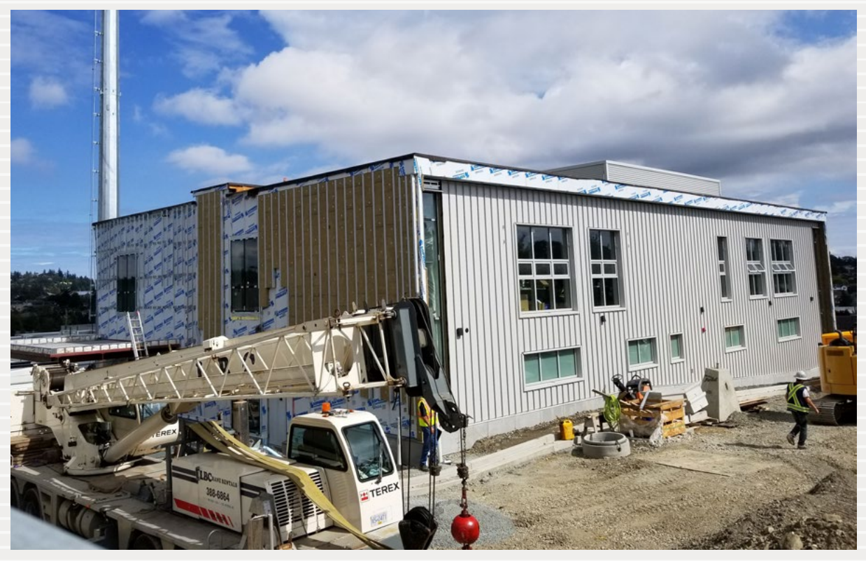
The South Island 9-1-1/Police Dispatch Centre's exterior is nearing completion.

Once the Capital Regional District wraps up the final requirements for the building occupancy permit, it will hand off the building to E-Comm for additional technical and operational outfitting.